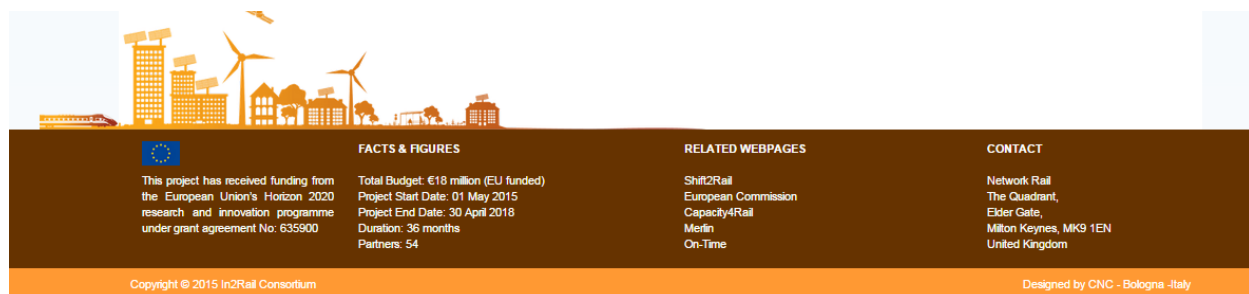
Figure 3 - Webpage Footer

The footer also provides information about facts and figures of the project and an acknowledgment of funding.